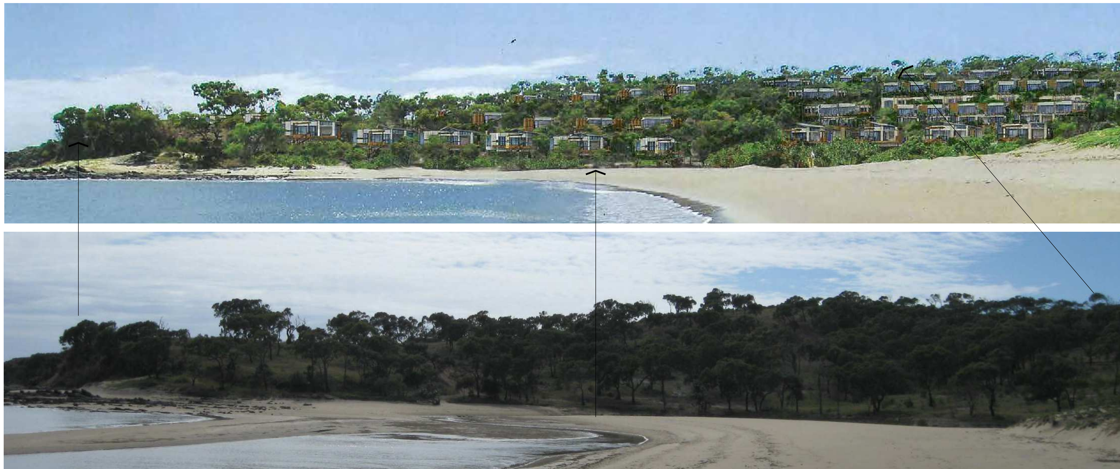
COMPARATIVE PHOTO MONTAGE- ACTUAL SITE PHOTO & ARTIST'S IMPRESSION OF DWELLINGS SET WITHIN TREED LANDSCAPE

TURTLE STREET BEACH RESORT CURTIS ISLAND CLIENT: QRE PTY LTD PROJECT NO: 100807.40 PLANS IN SERIES: 4 OF 6 DATE: SEPT. 2010